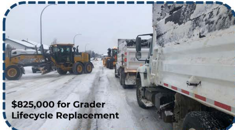
$825,000 for Grader Lifecycle Replacement