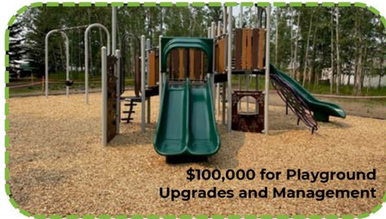
$100,000 for Playground Upgrades and Management