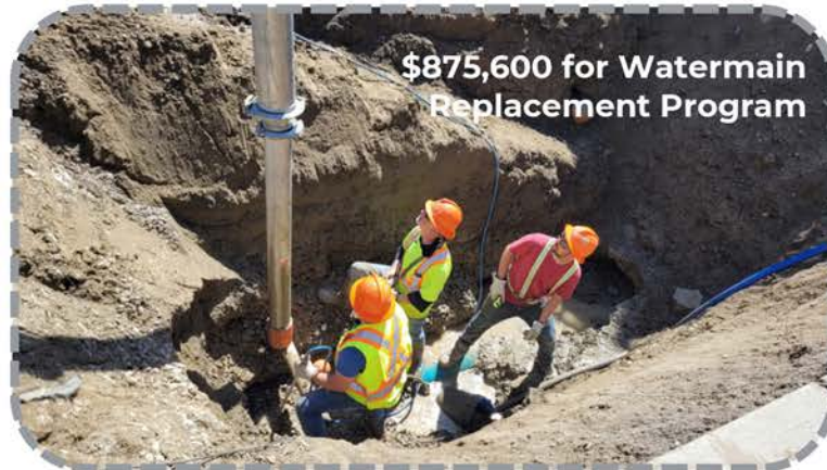
$875,600 for Watermain Replacement Program

$697,800 for Recreation, Social Services and Culture Capital Projects