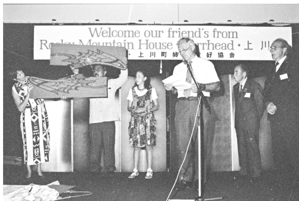
August 12, 1994 Rocky Mountain House delegation presented a gift to the Town of Kamikawa on the occasion of the 10th anniversary of twinning.