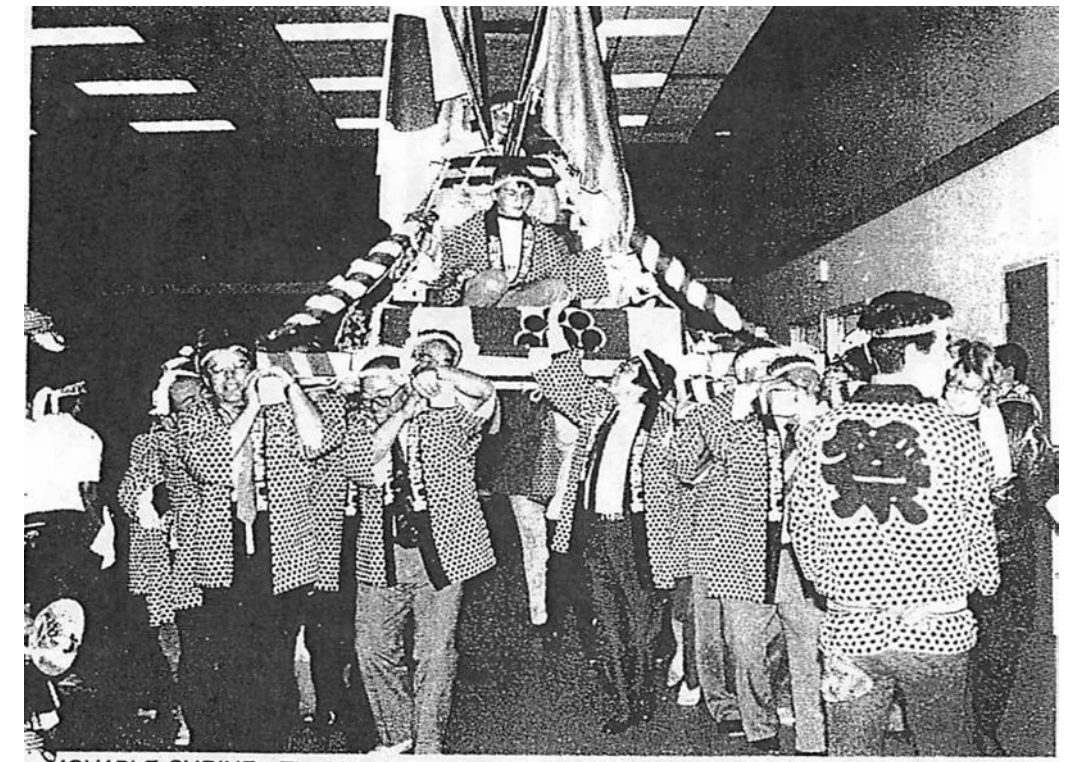
September 12, 1990 Members of the 1990 Kamikawa delegation built and presented a ceremonial Mikoshi to the attendees of Japanese Night.