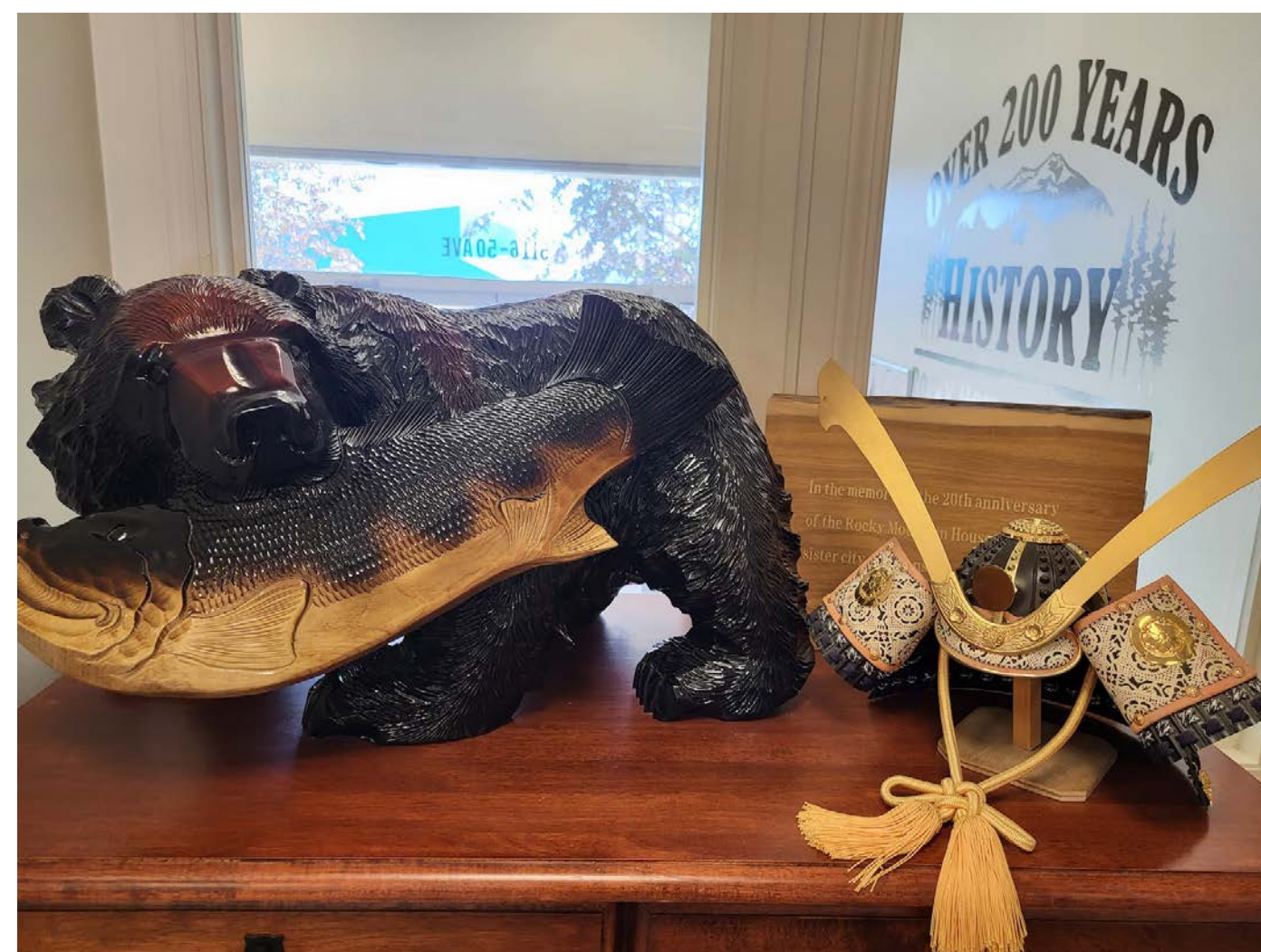
Gifts from the Town of Kamikawa on display at the Town Office.