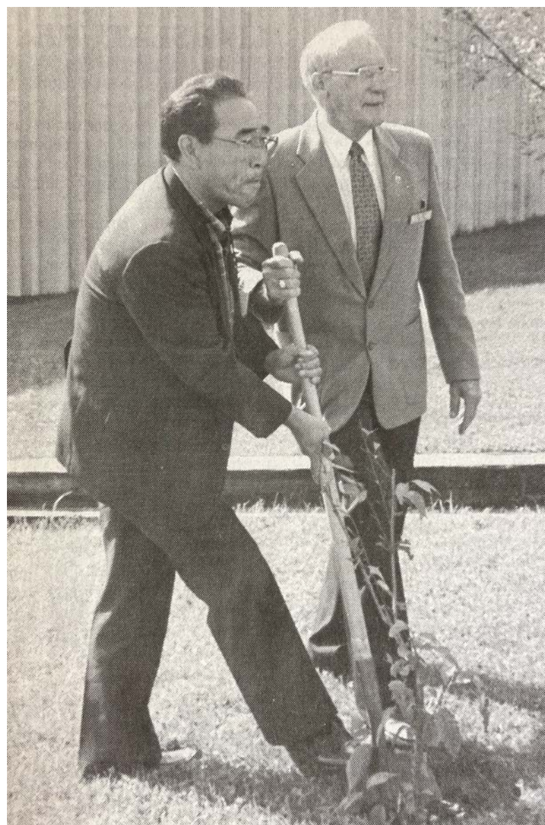
July 27, 1995 Cherry tree gifted to Rocky by Kamikawa planted in front of the municipal library.