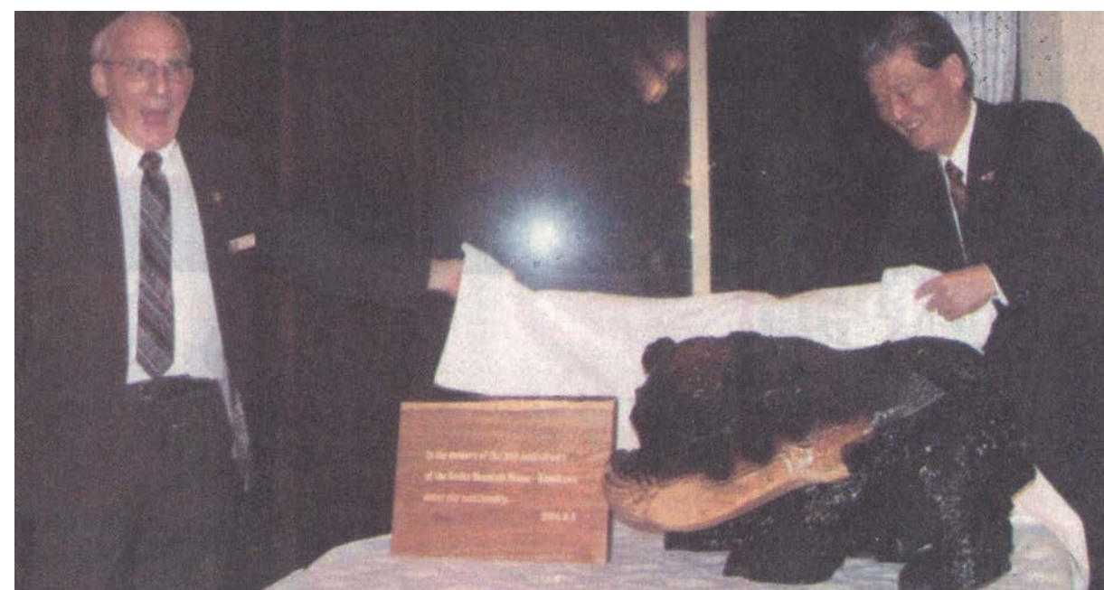
September 4, 2004 Kamikawa's Friendship Society presented Rocky Mountain House with a carved bear holding a freshly caught salmon in honour of the 20-year relationship.