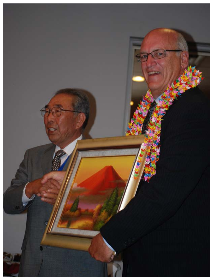
July 19, 2014 Kamikawa delegation presented gifts in celebration of Rocky Mountain House's Centennial Celebration.