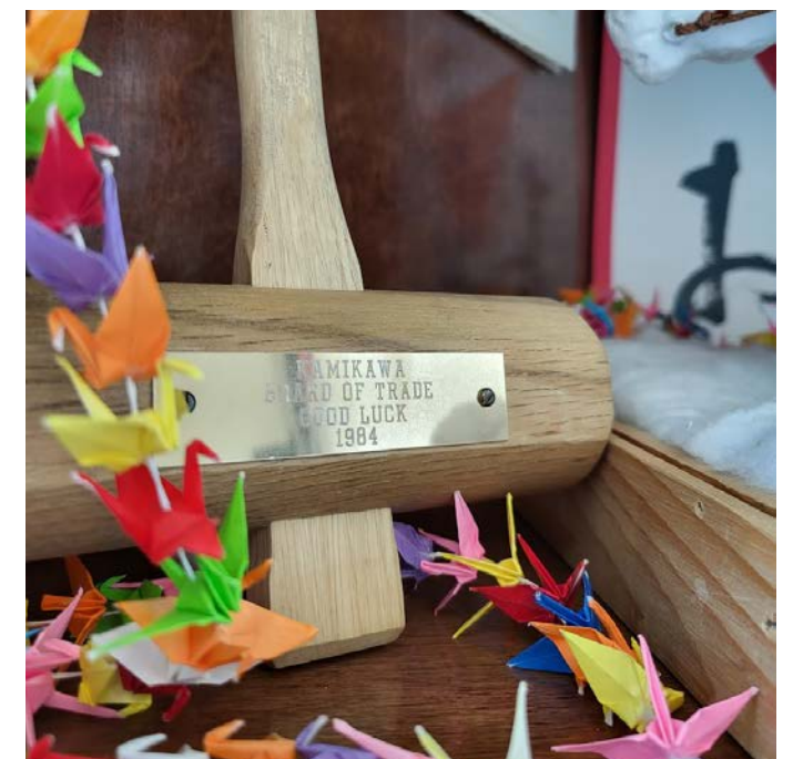
Gifts from the Town of Kamikawa on display at the Rocky Regional Recreation Centre.