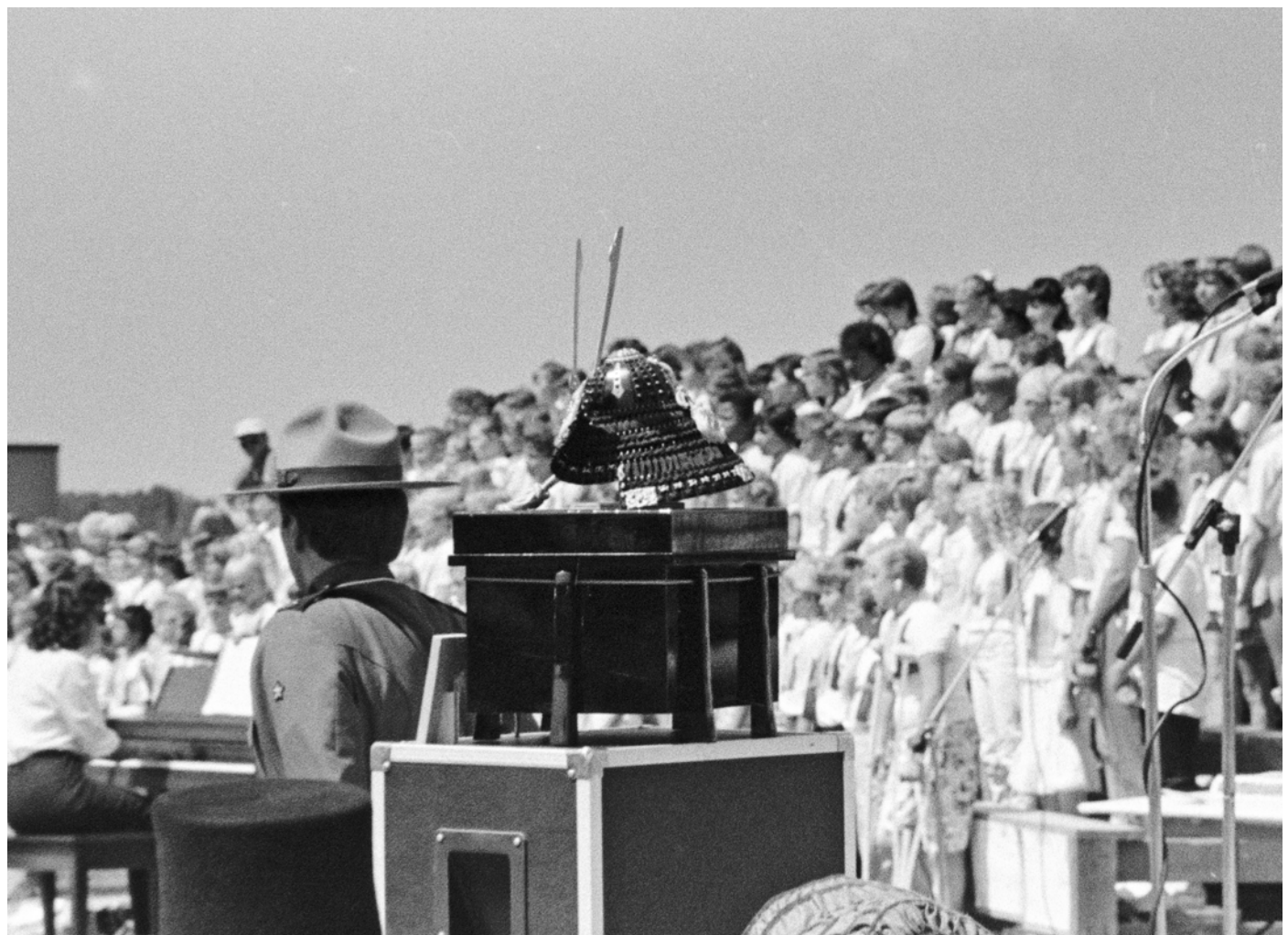
July 1, 1987 Kamikawa Friendship Mission delegation celebrated Canada Day at the Rocky Mountain House National Historic Site and presented a decorative samurai helmet as a gift for the Town of Rocky Mountain House's 75th anniversary.