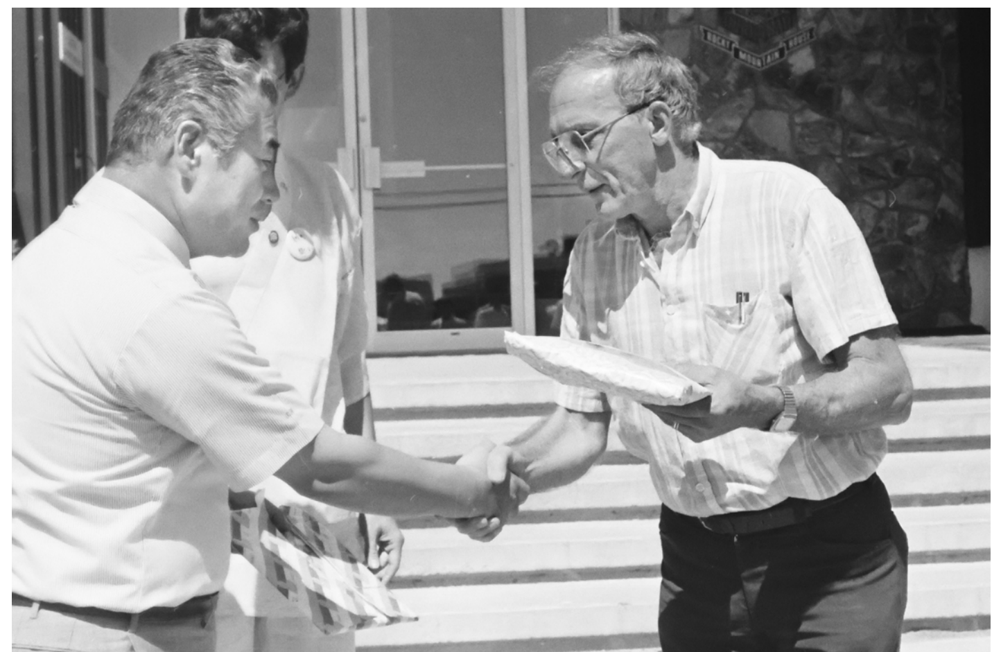
July 27, 1989 Kamikawa students visited Rocky Mountain House Town Office as part of the 1989-1990 student exchange.