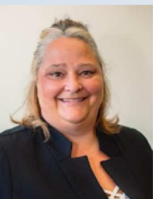
Mayor Debbie Baich