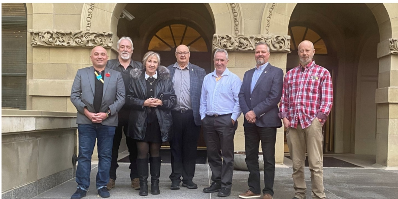
FROM TOWN OF ROCKY MOUNTAIN HOUSE COUNCIL

Wishing you a safe and healthy holiday season and a New Year filled with peace.