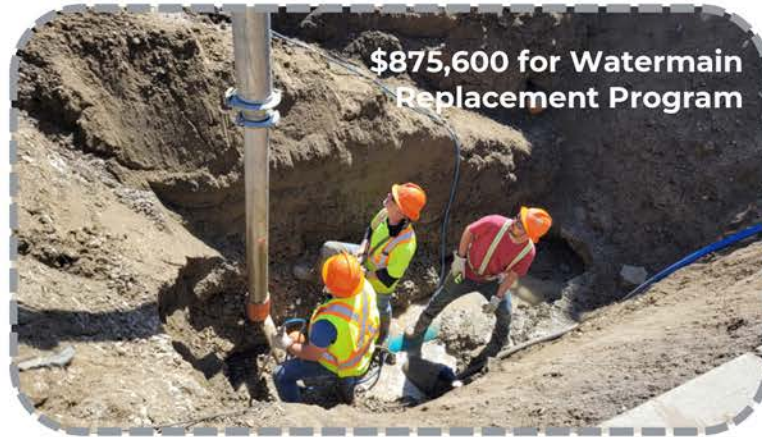
$875,600 for Watermain Replacement Program

$697,800 for Recreation, Social Services and Culture Capital Projects